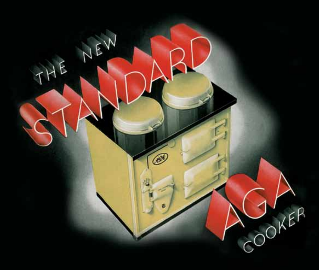
The 1935 Precedent